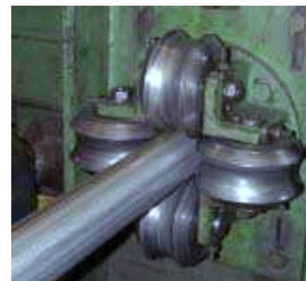
Turk-head rolls for round tube