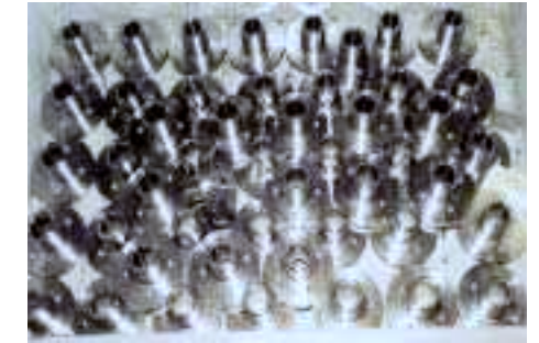
Steel holders for tungsten