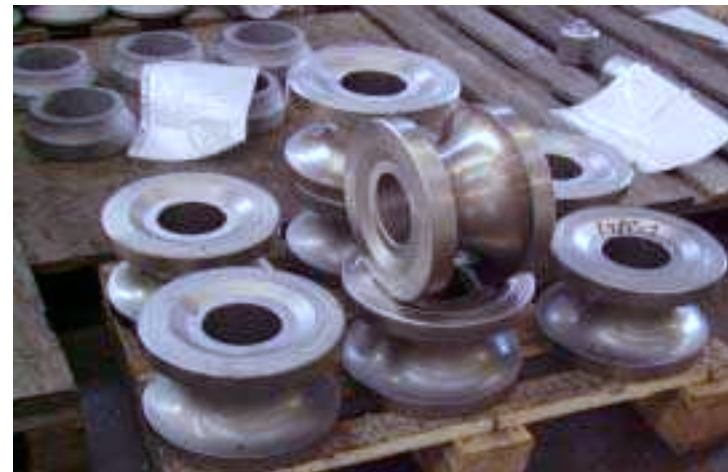
Sizing rolls after hardening