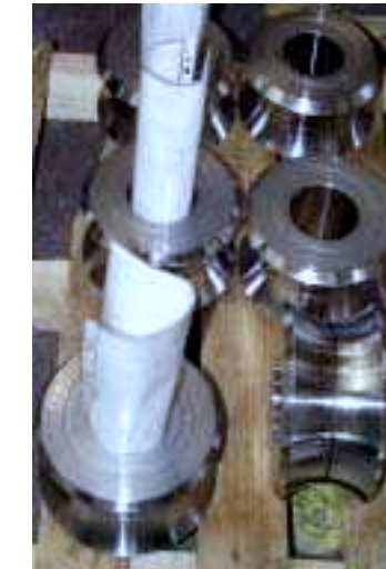
Welding rolls in steel quality AISI H11 / H13 hardened 52/54HRC