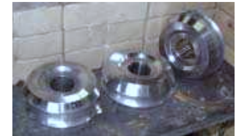
Hot reducing rolls