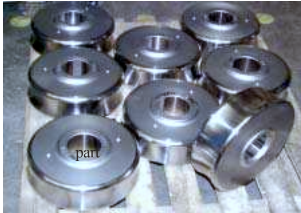
Rolls in AISI D3 hardened 58/60 HRC