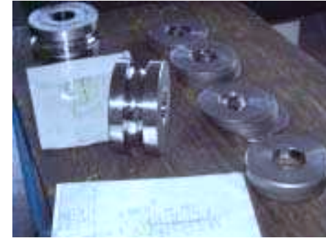
Finish passe rolls