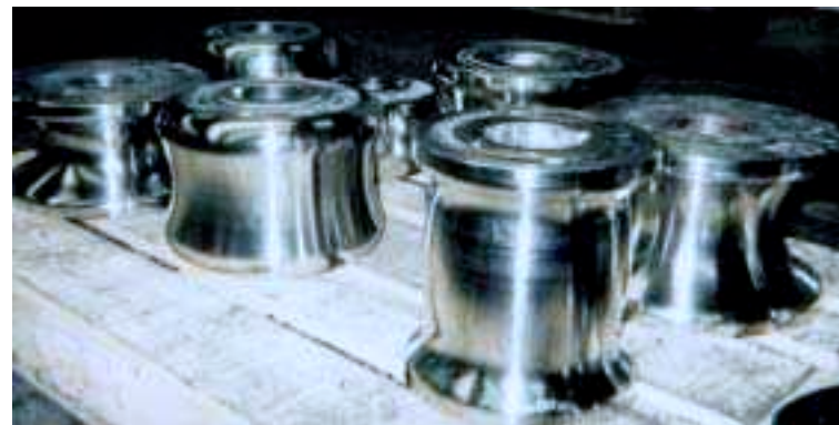
Tube Tools regrinding