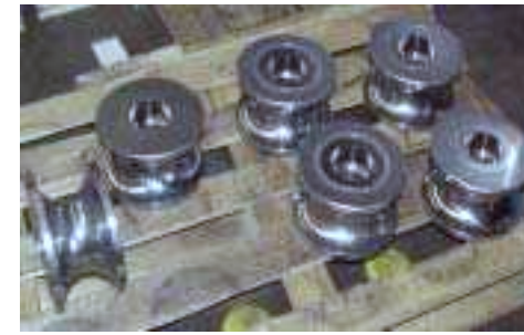
CrN coated rolls