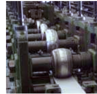
Standard forming tools