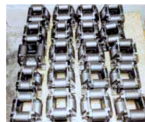
Turk-head rolls for square and rectangular tube