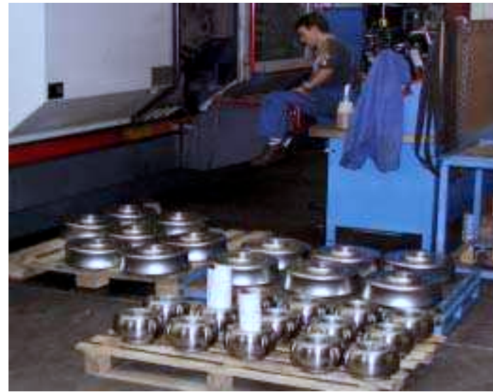
Rolls serial for bending or edging