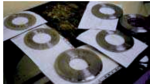
Blades for sheet metal slitting