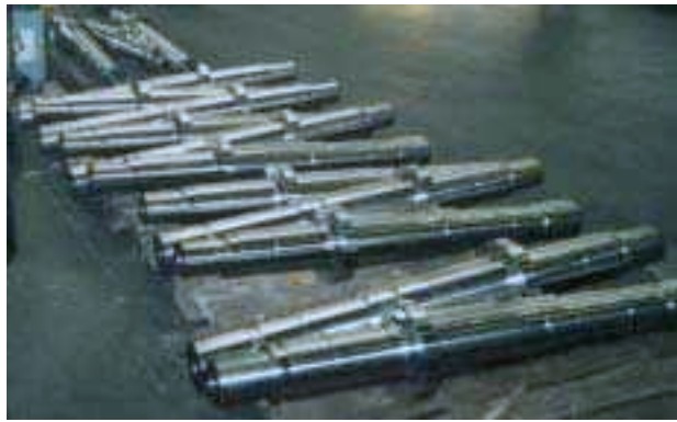
Shafts for dressing or forming rolls