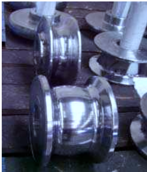
W shape rolls