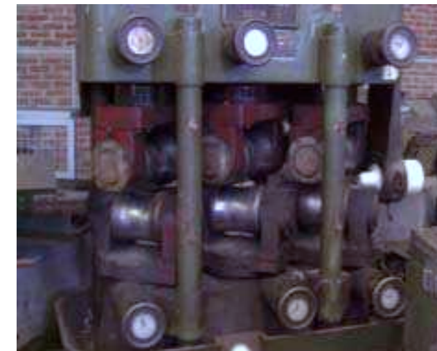
Straightener with 6 rollers for cold tube of small diameters