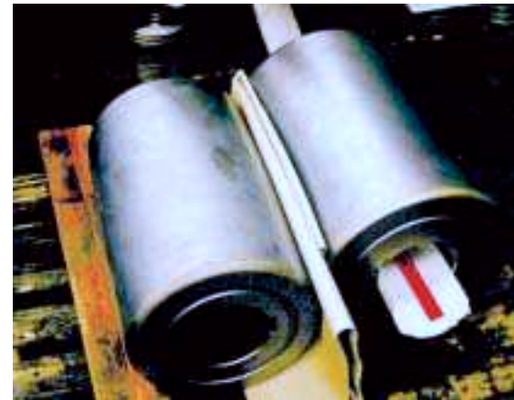
Hyperbolic rollers adjusters after treatment: hardened 58/60HRC