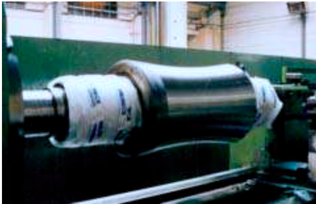
Improve and reprofiling of hyperbolic rolls on axis