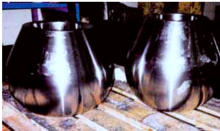
Roller diameter 450 mm, Weight: 320 Kg