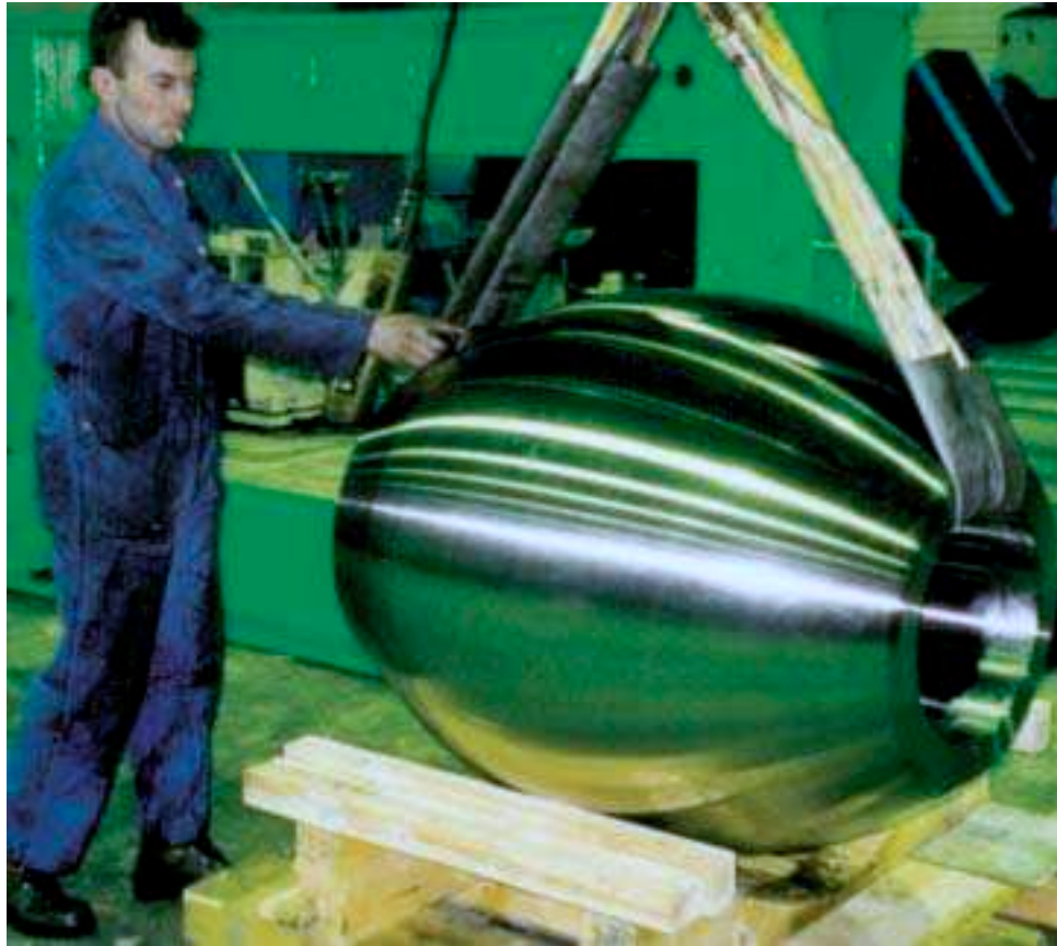
Roller diameter 910 mm, Weight: 2.850 Kg