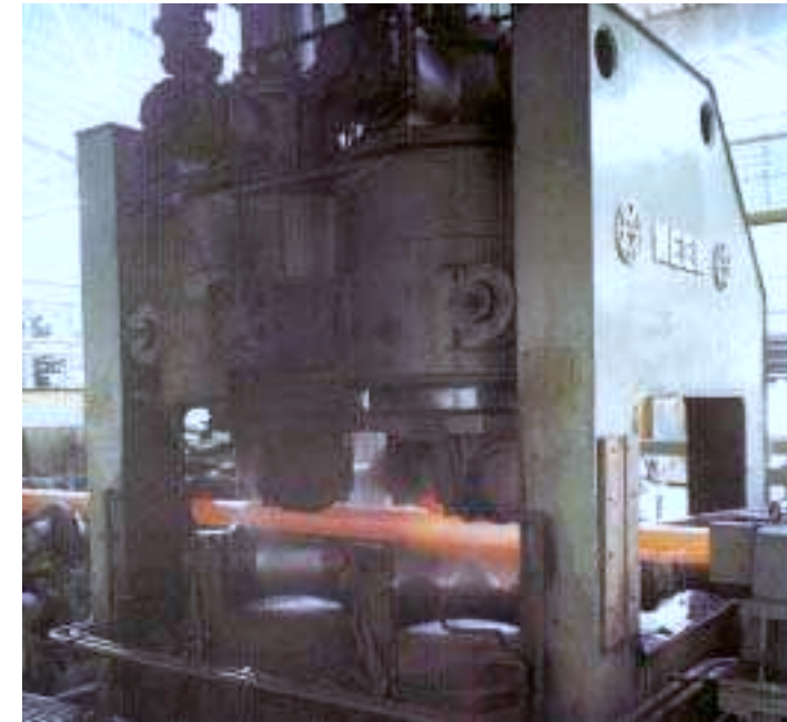
Straightener with 4 rollers for large-sized hot tube