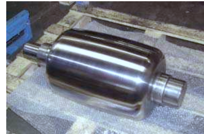
One piece Straightening rolls