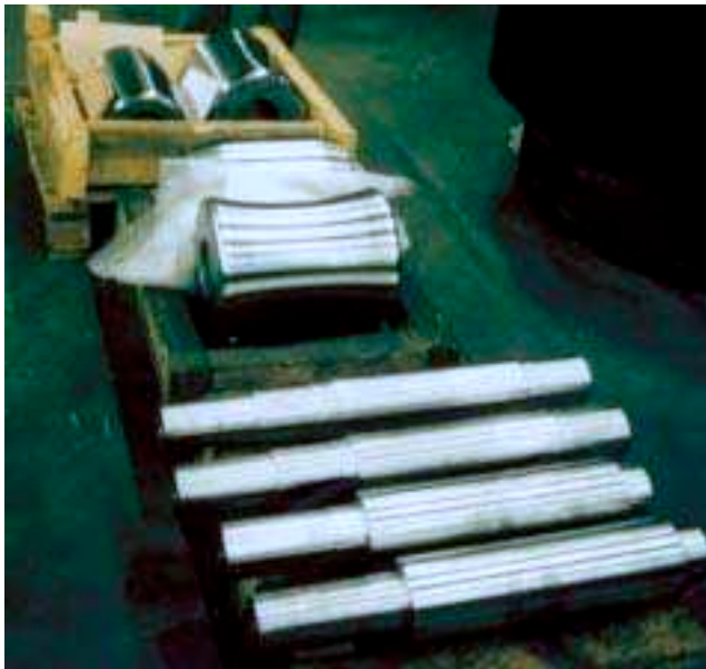
Axles and rollers before hooping